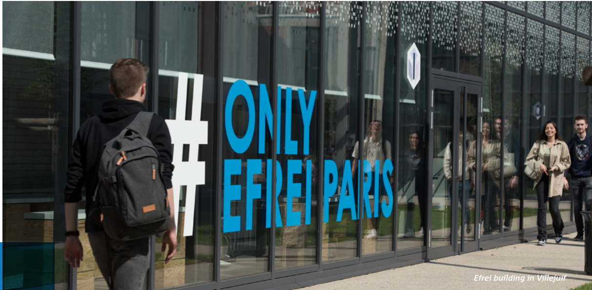
Efrei building in Villejuif

Founded in 1936, Efrei has continuously developed through technological advances to become the best private IT Engineering School in France. We teach 5,000 students across undergraduate and graduate programs in Paris and Bordeaux, in the fields of Engineering, Cybersecurity, web development, digital transformation, management, and marketing. Efrei Executive Education also offers short programs for professionals and companies who wish to upskill or to retrain in a new field.