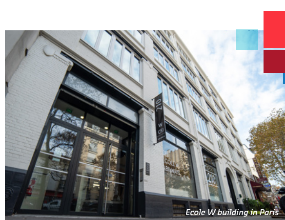
Ecole W building in Paris

It trains students with two to five years of higher education, using teaching methods that are based entirely on practical cases and which involve students in project work on a daily basis, developing their skills, creativity, independence, team spirit and confidence throughout their studies.