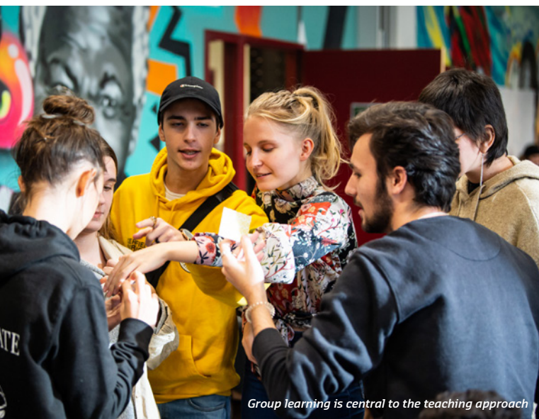
Group learning is central to the teaching approach

Project-based training empowers students to become truly multi-skilled technicians with agility and curiosity, exactly the profiles that are increasingly in demand for companies today. Teaching is organized as themed sessions, led by working professionals (journalists, scriptwriters, art directors, entrepreneurs, graphic designers, video makers...).