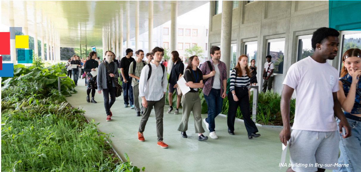
INA building in Bry-sur-Marne

INA—Institut National de l'Audiovisuel, the French Institute for Media Heritage—is a unique media organization. This public service institution hosts decades of television, radio and web archives, conserving, digitizing and distributing one of the largest media collections in the world. INA also supports cultural and educational partners in France and around the world to promote heritage media.