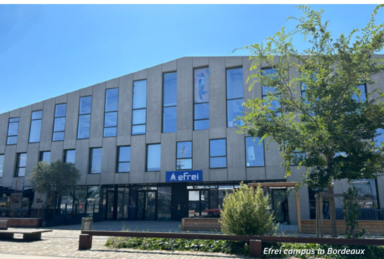
Efrei campus in Bordeaux

Our project-based learning methods, our 65 associations and clubs, the combination of soft and technical skills and our professional Learning Experience program make the Efrei experience unique. Also, all our students are followed by a Student Success Advisor to accompany them in accomplishing their projects and put them on the road to success. Our 14,000 graduates have gone on to lead successful careers in IT engineering and management positions, helping to shape new technologies and accompany the digital transformation currently taking place.