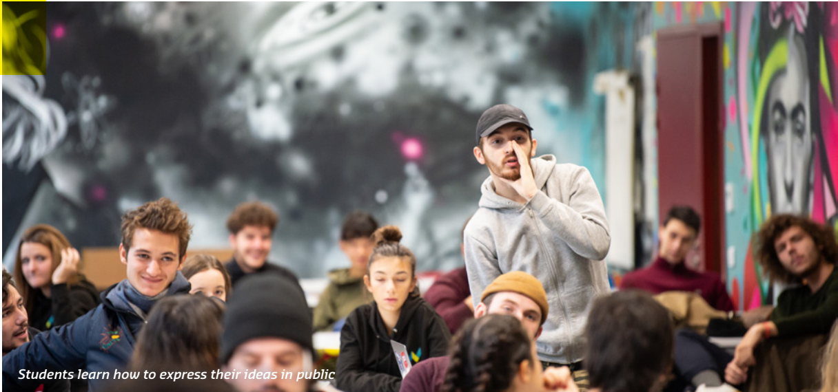
Students learn how to express their ideas in public

École W was founded in 2016 by the Centre de Formation des Journalistes (CFJ) to teach the art of storytelling in all its forms, whether in sound, in images or in writing. It offers a range of specialized courses on a work- study basis or as in-service training, in a variety of fields: photography, audiovisual editing, journalism, communication, fiction & documentary writing, digital artistic direction and events management.