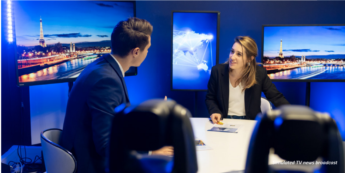
Simulated TV news broadcast