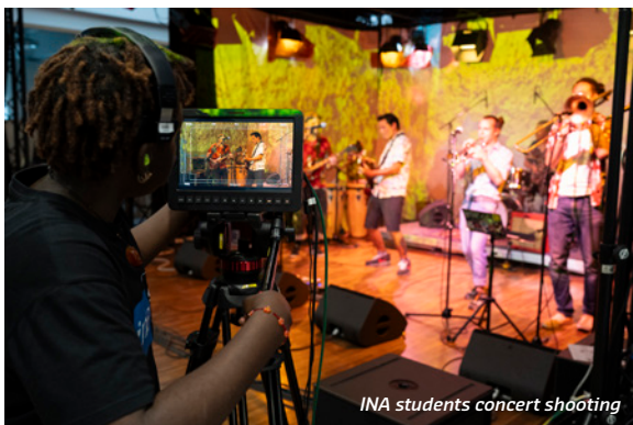
INA students concert shooting

INA's continuing education curriculum spans 6 areas of study, Digital image — Media — Digital heritage — Multimedia documentation — Production, writing and directing — Sound and Audiovisual techniques, offering a wide range of skillsets in various professions thanks to its network of more than 350 teachers and speakers, each of whom is a seasoned professional in his or her field.