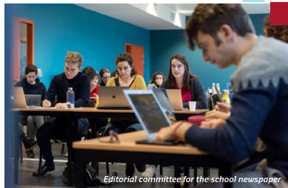
Editorial committee for the school newspaper