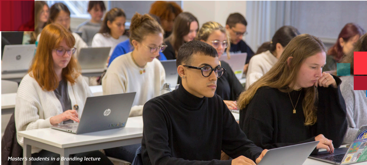
Master's students in a Branding lecture

ISIT (Institute of Intercultural Management and Communication) in Paris is the Grande École for multilingual leadership and change management, specializing in translation, interpreting, international law, international communications and international relations.