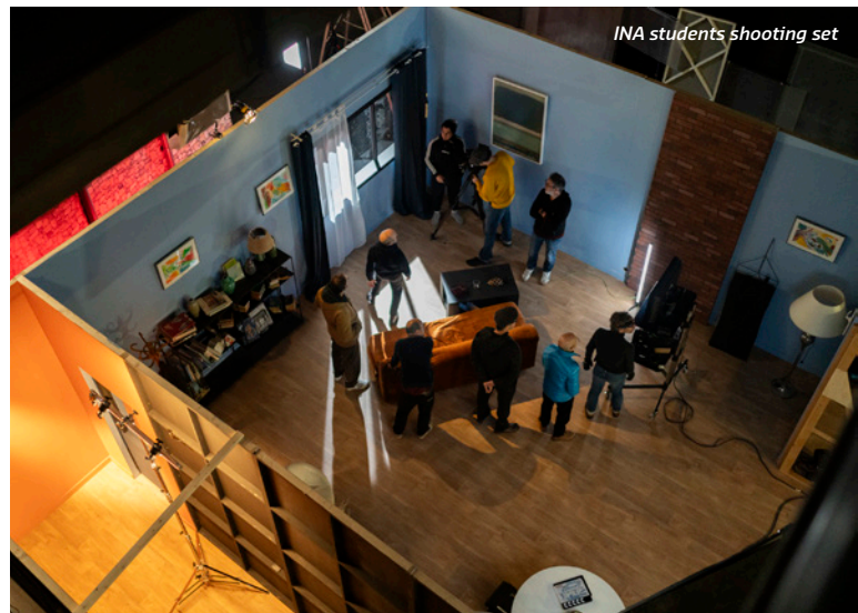
INA students shooting set

INA offers graduate-level and mid-career training curricula in both traditional and digital media. Home to an elite school accredited by the French Ministry for Culture, it offers top-level higher education in media production, sound, image, media archiving and audiovisual engineering: over 80% of INA's alumni find a job within a year of graduation thanks to its officially recognized diplomas.