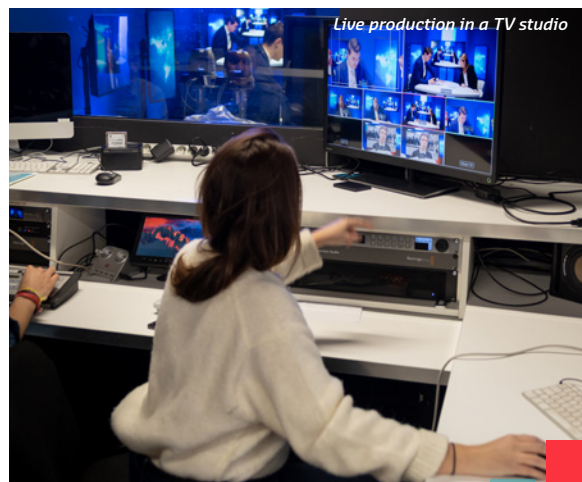
Live production in a TV studio

Admission to CFJ's determinedly practical training in journalism is open through a public selection process, for holders of a first degree. CFJ's continuous innovation program adapts the training offer to changes in the profession. Today the school offers several journalism curricula in either Paris or Lyon, which can be followed either as a full-time student or under an apprenticeship contract: