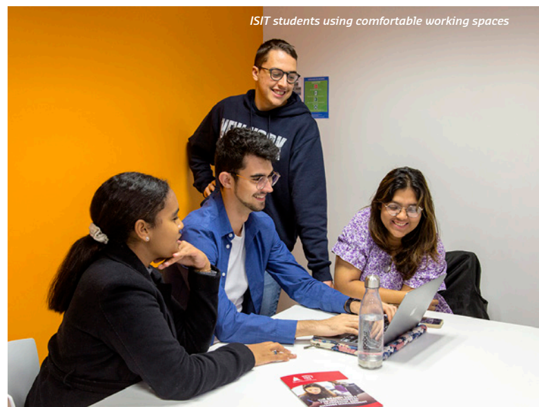
ISIT students using comfortable working spaces

ISIT is a dynamic and stimulating place of learning, where students acquire the skills, knowledge and agility to become vital facilitators for tomorrow's international companies and organizations.